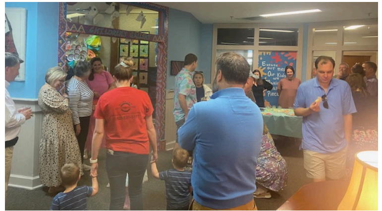
Images from Adkin Mural Reception and St. Mary's Preschool Reception

"The aim of art is to represent not the outward appearance of things, but their inward significance." – Aristotle